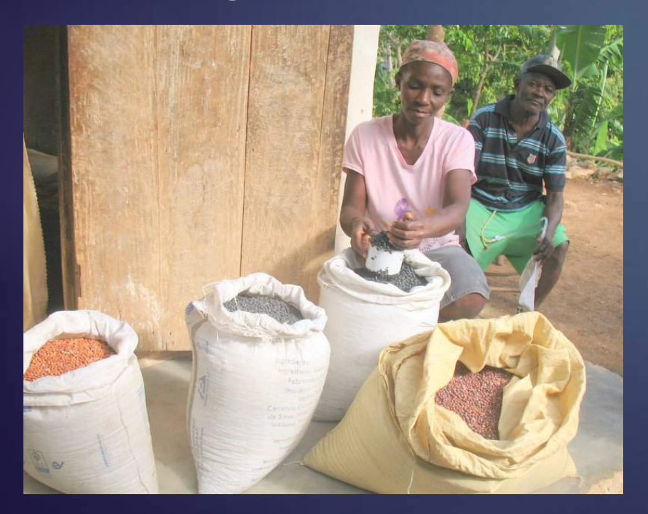
PHOTO: Tree nursery participants earn crop seeds, allowing them to increase their harvests.

The short term goal is for each pilot community to be enrolled in a tree currency program and a microcredit program.