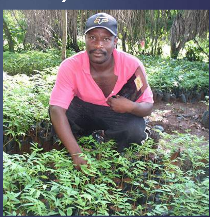
PHOTO: Farmers work in tree nursery programs, increasing family income 50%-100%.

Improving the lives of individual farmers and community members.