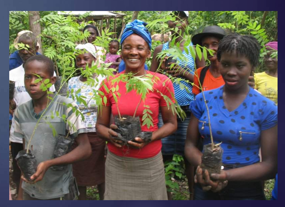
PHOTO: Tree currency program helps the environment, increases income, improves food security and fosters gender equality.

The long-term goal is for many of Haiti's 572 rural communities to participate in 3Legs, empowering Haiti to lift itself from poverty.